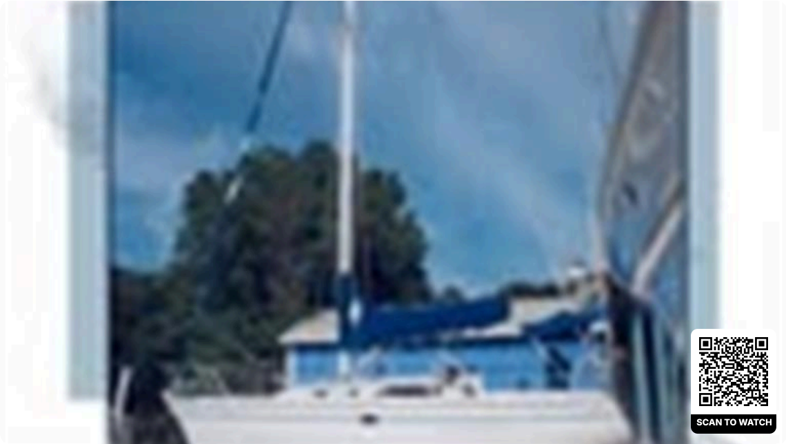
Len Berman Memorial Photo Slide Show

Maggie Ewell shared a video to the Len Berman Memorial Photo Slide Show album. April 22 at 4:43 PM